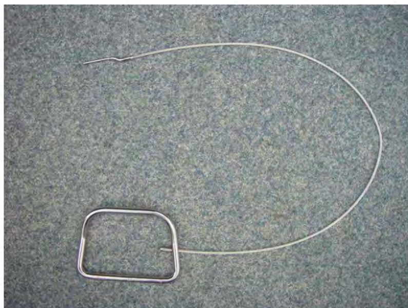
Pic. 2 Ripcord Handle U-051