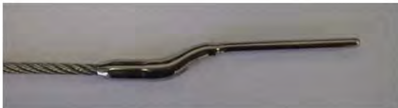
Pic. 4 B Pressed pin – bent, hexagonal press