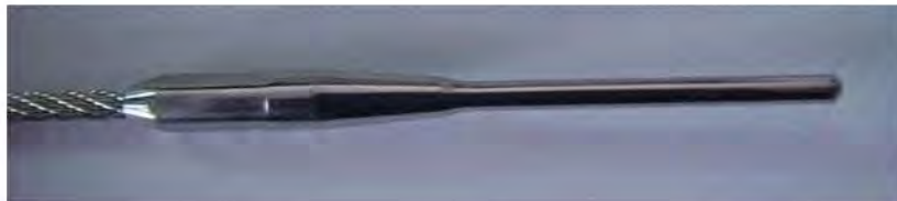
Pic. 4 A Pressed pin – straight, hexagonal press (e.g. the press at the line has the hexagonal shape)