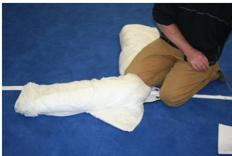
Step 18 Slide the left ear 90° forward while still kneeling on the base.