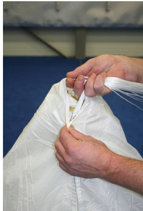
Step 8 / 3