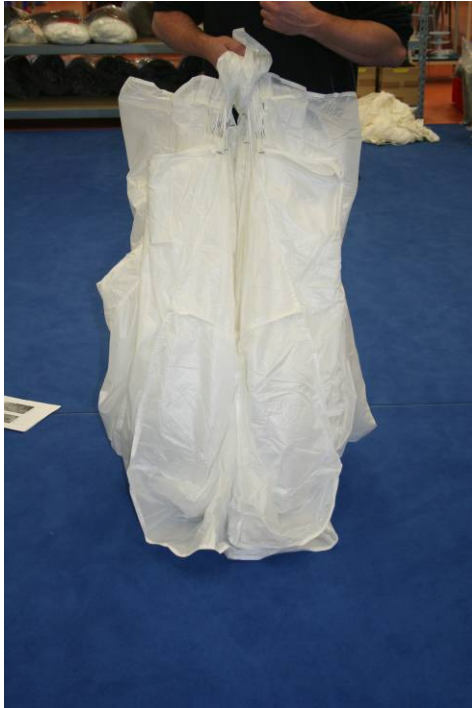
Step 6 / 3 Correctly folded canopy shown from trailing edge side.