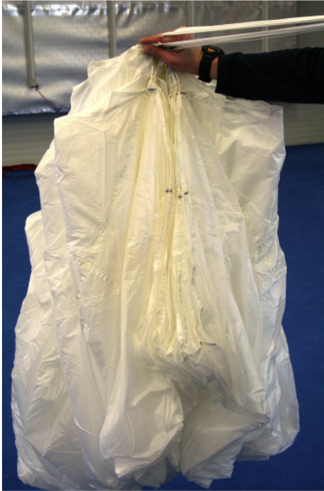
Step 7 / 3 Open nose of canopy.