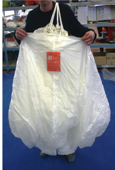
Step 8 / 1 Pull up the centre cell with the trailing edge and position it just above the slider grommets and around the line strand. See details on next picture.