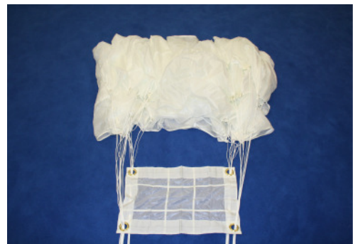
Step 4 Prepare the canopy for packing by moving the slider up to the base of the canopy.