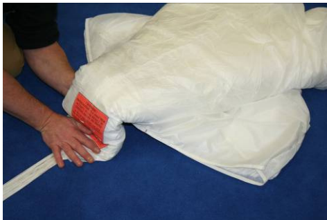
Step 13 / 1 Perform a S-fold backwards towards the line strand.