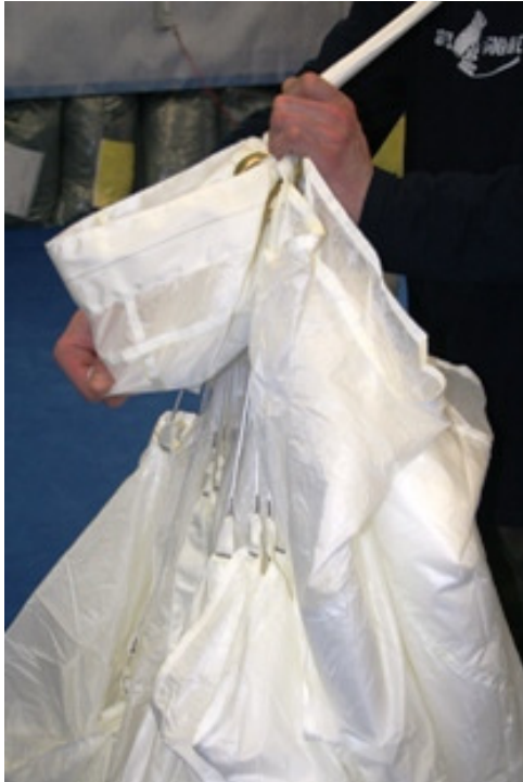
Step 7 / 1 Slider before being centred be- tween B and C lines.