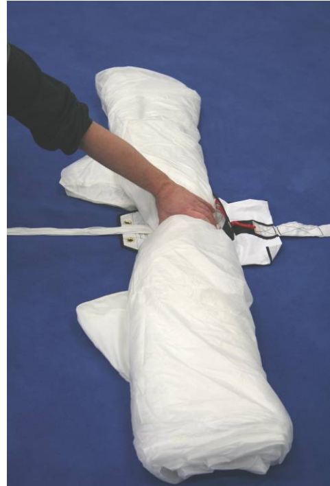
Step 17 By doing as described in Step 16, you receive a configuration as shown in this picture. This will allow you to grab the very small base of the pack job and be able to lift it up to position the reserve bag right underneath the base. The base goes in the bag first and stays nice and unaltered.