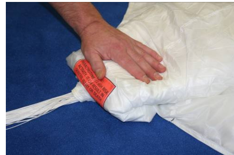
Step 13 / 2 The finished S-fold