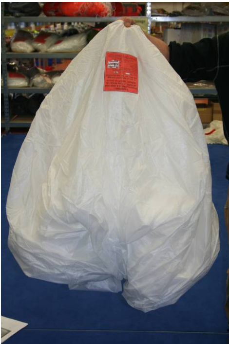
Step 8 / 2