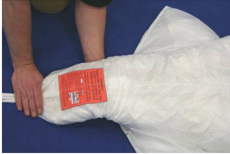
Step 12 Narrow down the base of the canopy even more to be able to grasp it with one hand.