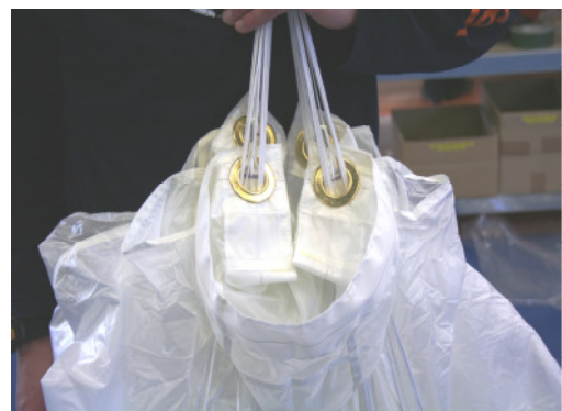
Step 7 / 2 Slider centred.