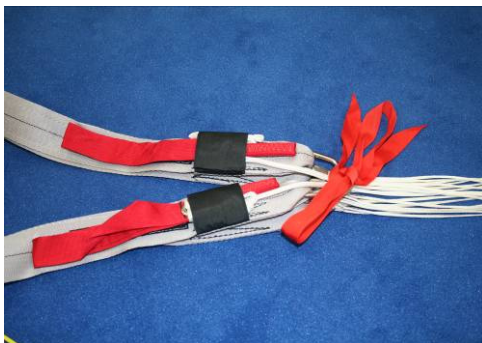
Step 3 Tie the connector links together using a easy to see ribbon. Make sure you tie the steering lines in with it.