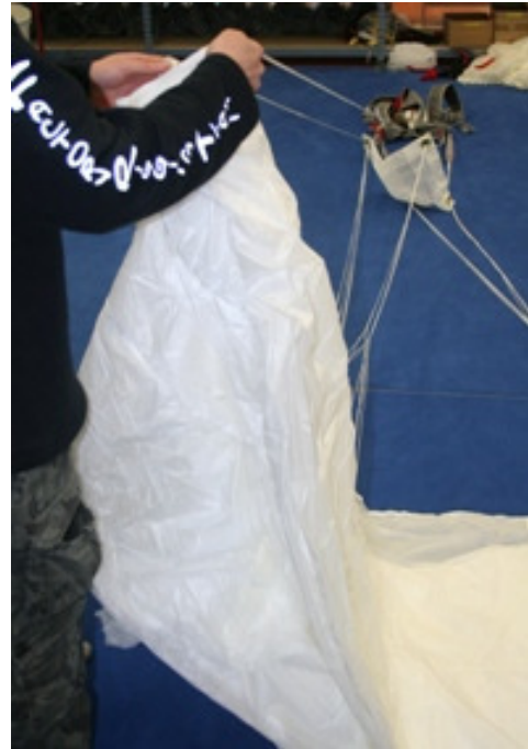
Step 2 Perform a line check by making sure the steering lines run free through the sliders grommets to the steering toggles.