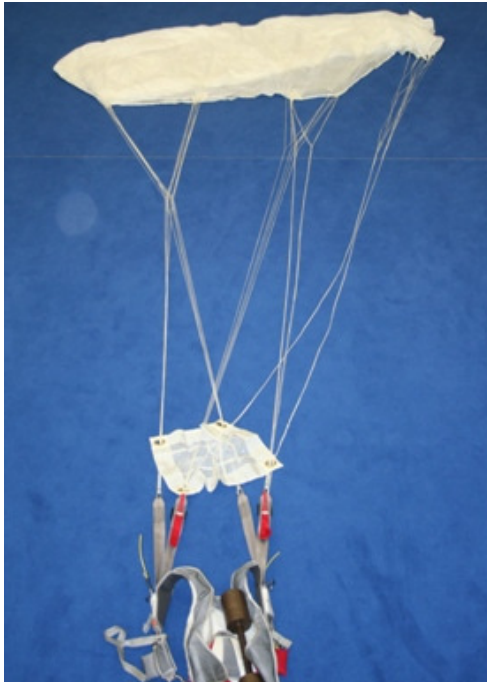
Step 1 Lay out the parachute and sort the lines.