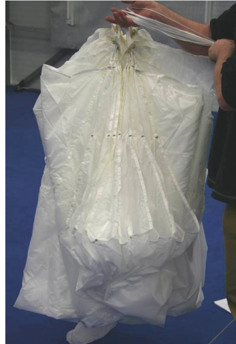
Step 6 / 4 Correctly folded canopy shown from leading edge side.