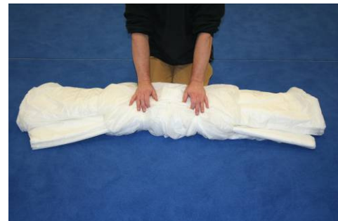
Step 15 Dressing the centre cell in it's reefed configuration.