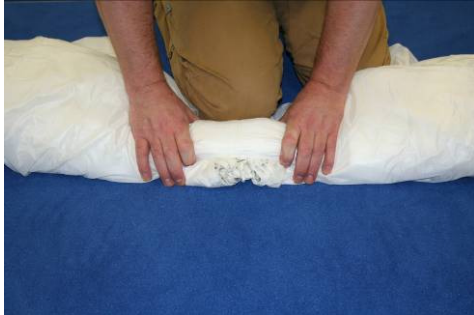
Step 16 Roll the centre cell forward and on top of the base S-fold.