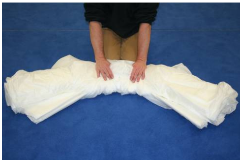
Step 14 Spread the canopy down the centre and start reefing up the centre cell. Make sure to kneel on the base S-fold to keep it securely in place.