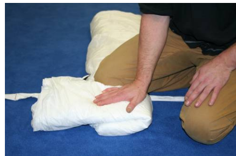
Step 19 Perform a S-fold with this ear by dividing it in thirds.