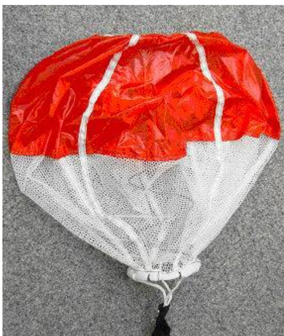
Pilot parachute PV – 038