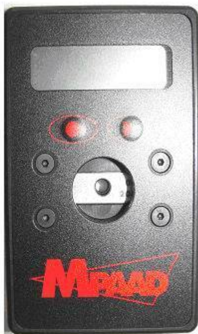
The size of the device is 100 x 62 x 20 mm.